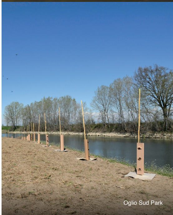
Oglio Sud Park