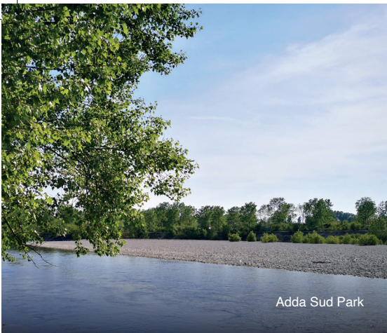
Adda Sud Park