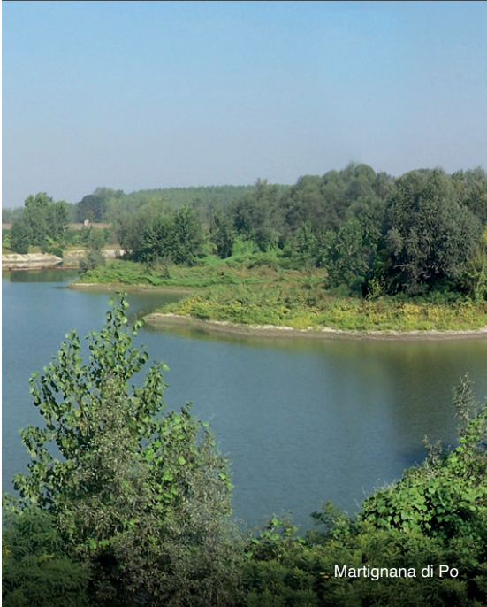
Martignana di Po