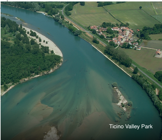
Ticino Valley Park