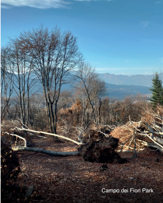
Campo dei Fiori Park