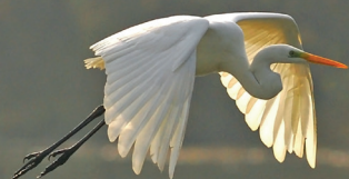
Oglio Nord Park