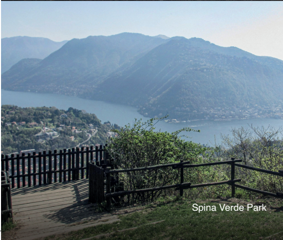
Spina Verde Park