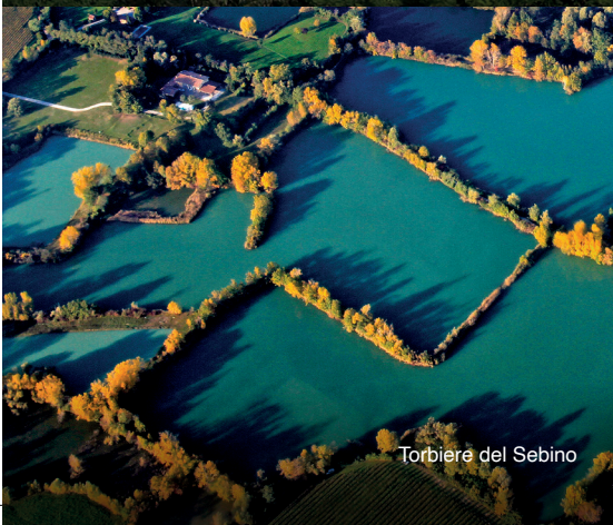
Torbiere del Sebino