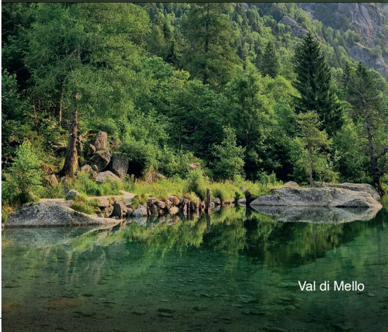
Val di Mello